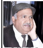
By Vijay GarG

Everyone is familiar with the evaluation of IQ (Intelligence Quotient), but in the last few years there has been a great deal of talk about EQ, the Emotional Quotient. We all have emotions and they affect us every day. When we observe our lives closely we notice three aspects to it: action, emotion (feeling), and thought. We may consider these aspects as being separate but actually they are not, for there cannot be any action without thought and feeling. However, we also know that thinking is not the same as feeling for each has a different effect. For example, there are people who are highly intellectual, they speak and write very logically, yet they often fail to touch the hearts of other people. While, some people appear to do very little, but somehow those little actions touch people's hearts. We see the same with music; a musician may present a technically perfect piece of music yet be unable to delight the hearts of the listeners while a simple rendition with intense feelings may move everyone.