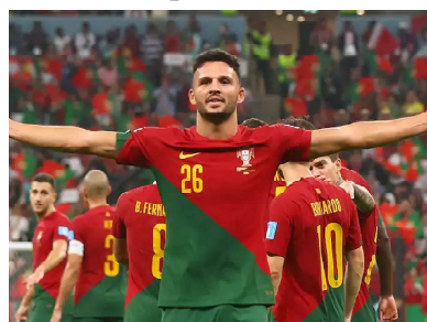
Goncalo Ramos celebrates after scoring against Switzerland.

The FIFA World Cup 2022 round of 16 came to an emphatic end with Portugal thrashing Switzerland 6-1 in the final pre-quarterfinal match at the Lusail Stadium on Tuesday. Earlier on the same day, Morocco stunned Spain by making the round of eight in penalties. Portugal will face Morocco in the quarterfinals. The other quarterfinal line-ups are France vs England, Brazil vs Croatia and Netherlands vs Argentina. The Qatar showpiece has not been short of surprises and records. Ramos Joins Elite League Tuesday was the same. Portugal youngster Goncalo Ramos became the first footballer to score a hatrick on World Cup debut since 2002 when Miroslav Klose of Germany did it. He also became the second Portuguese to have four goal